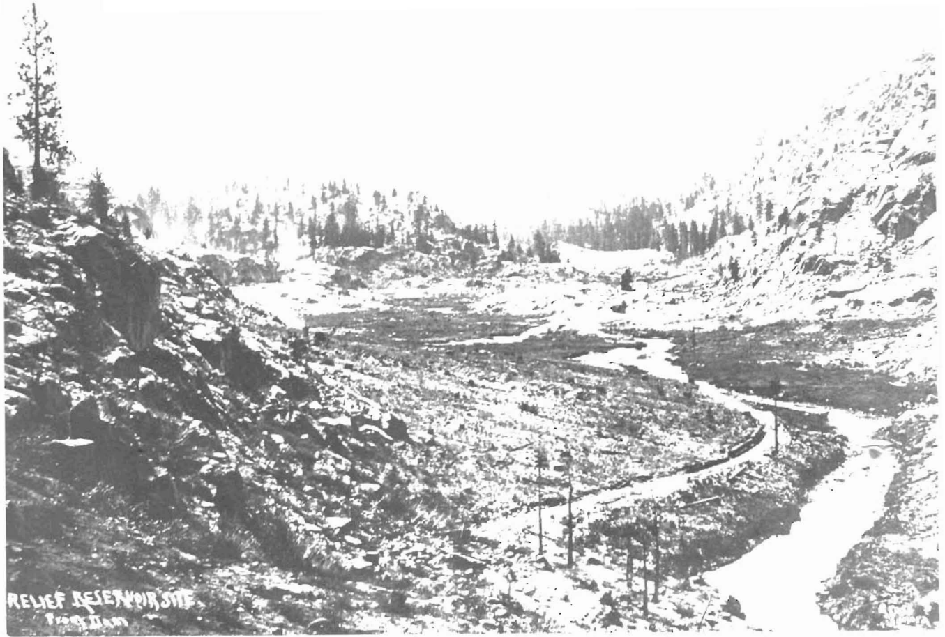
Looking From Face of Relief Dam - This is all under water now.