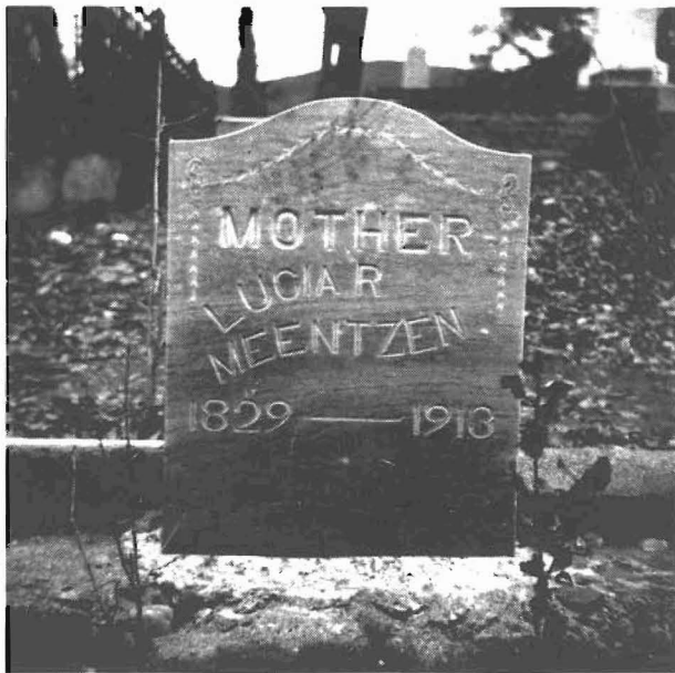
Neentzen Family Plot Sonora City Cemetary